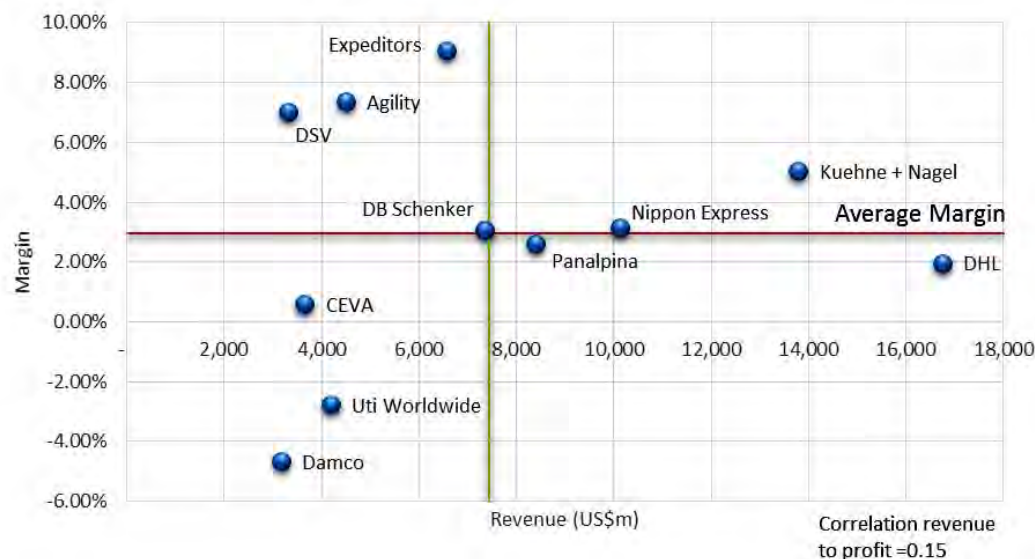
Chart 3: Freight Forwarder Revenues and Margins

Despite very similar business models, the diversity in levels of profitability between companies is remarkable. The chart below shows the considerable variance between best-in-class profitability and those forwarders performing least well. It is also evident that scale is no guarantee of profitability. Some small players have very good margins, but at the same time, some make big losses.